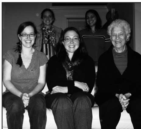
RCS alumnae gathered in DC for an evening of concert viewing and choral anecdotes on November 9th.