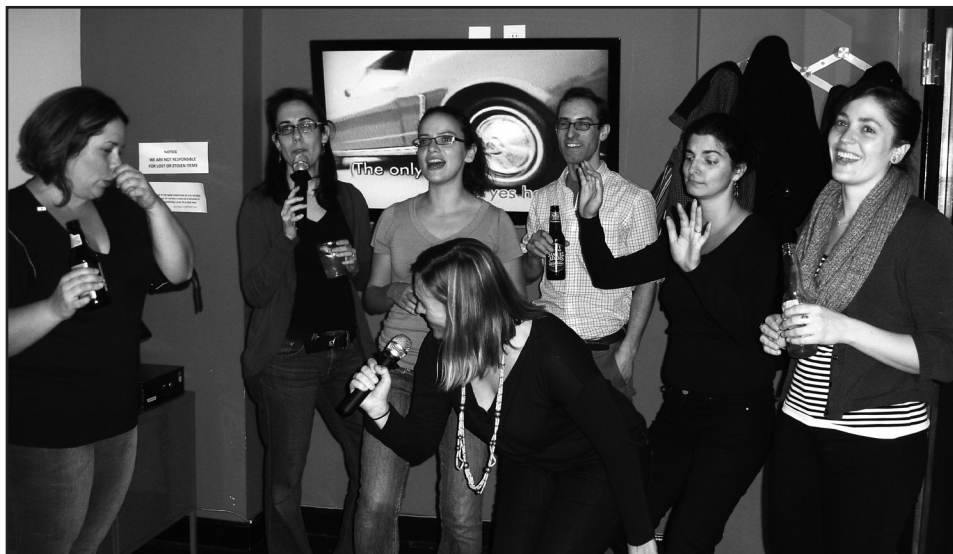
RCS alumnae plus Holden friends belting out tunes at a karaoke night in DC on November 17th.

We are happy to announce that we will be increasing our focus on non-Boston alumnae activities! We'll be streaming 2-3 concerts a year so alums can watch RCS live, remotely. Further, we'll encourage you to watch these concerts together if you live in a place with a concentration of Holden alumni (with refreshments provided by RCSF)—this has already happened in NYC and DC. We are also looking to support fun group events, such as the recent karaoke night in DC or other music-related outings. We'd love to hear and provide support for your ideas for bringing alumni together in your area! Email kkannan@post.harvard.edu with ideas or to volunteer as a local contact.