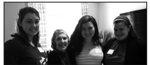
RCSers, Alumnae, and residents converse at the Youville Sing on March 10.