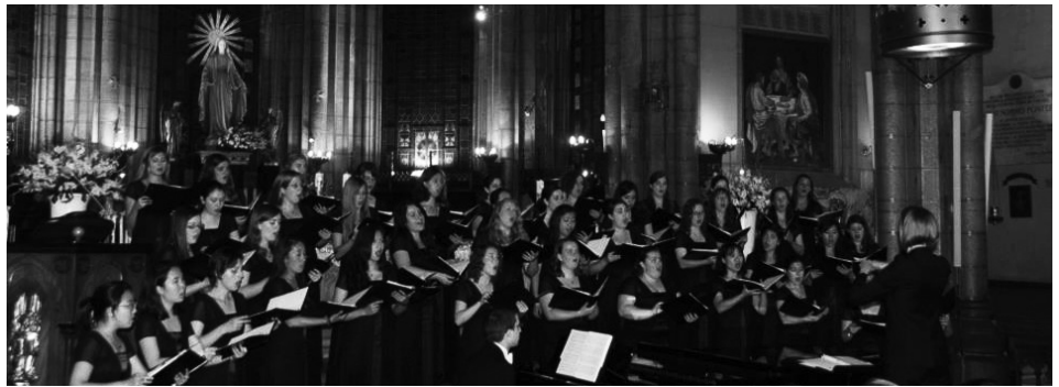
RCS singing with Kultur University in St. Antoine's Church, Istanbul.