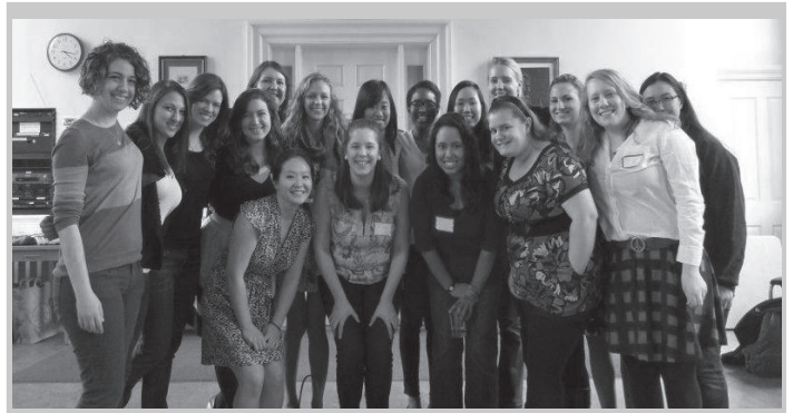
Alumnae and current members of the 'Cliffe Notes celebrate 20 Years of Harmony.