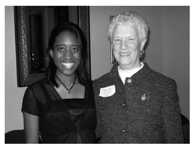
Tour 2010 Receptions

This year's spring tour featured post-concert receptions organized by and for local alumnae in each tour city. These receptions were one of the highlights of tour, as they provided RCS alums and current singers a chance to get together for conversation and refreshments after the concerts. Attendance at each reception reached around 100 people, including current singers, alumnae from the classes of 1954 to 2009, and RCS friends, family, and tour hosts. In addition to the connections and reconnections made among RCSers past and present, the receptions featured a few words from RCS and FRCS leadership and entertainment from the 'Cliffe Notes.