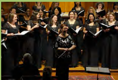
Photo taken at Taft Concert, 2/14/08.