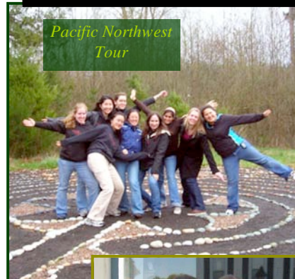
Pacific Northwest Tour