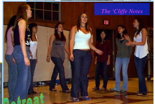
The 'Cliffe Notes