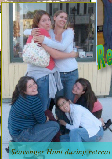
Scavenger Hunt during retreat