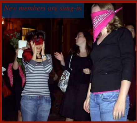
New members are sung-in