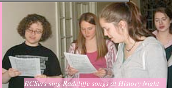
RCSers sing Radcliffe songs at History Night