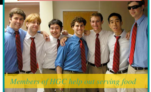
Members of HGC help out serving food

We're on the Web! See us at: www.radcliffechoralsociety.org