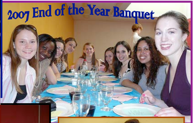
2007 End of the Year Banquet